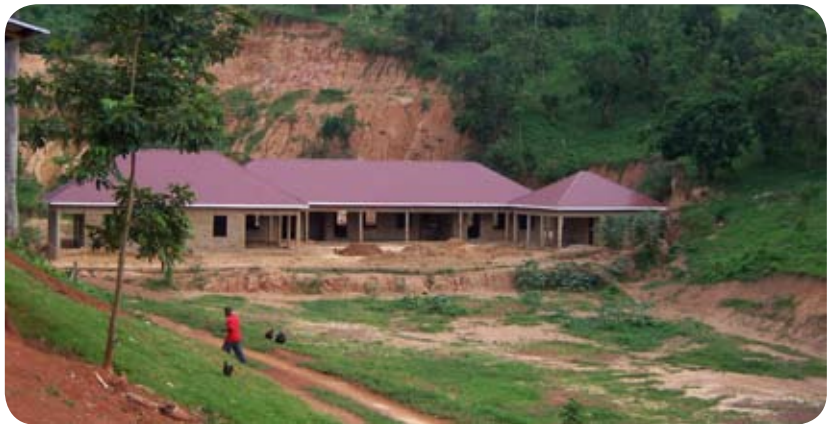
The new kindergarten