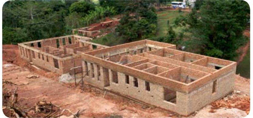
Construction of houses 8 & 9

We thank God for His faithfulness and glory be to Him.