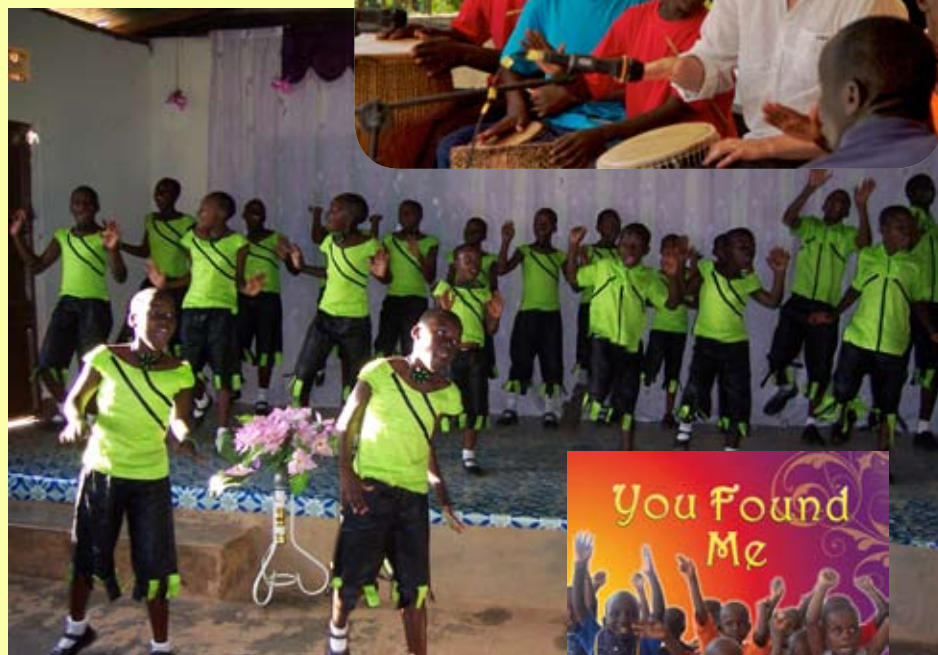
New album recorded by KCC's children's choir