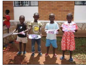
Letting our paintings dry in the sun at KCC!

The fourth house is completed and number five is on the way.